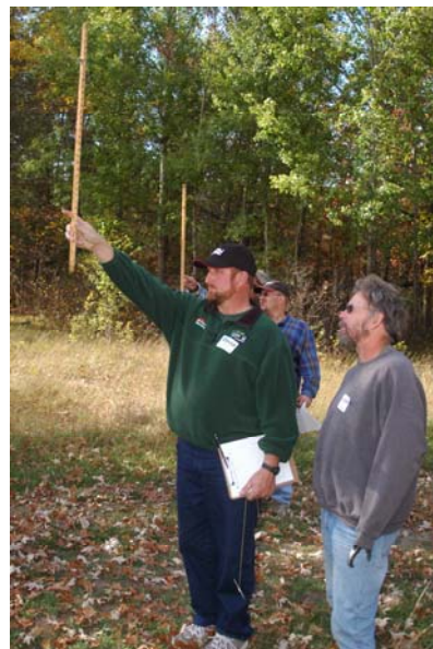
Photo: Workshop participants calculate tree height and diameter during a timber cruising exercise.